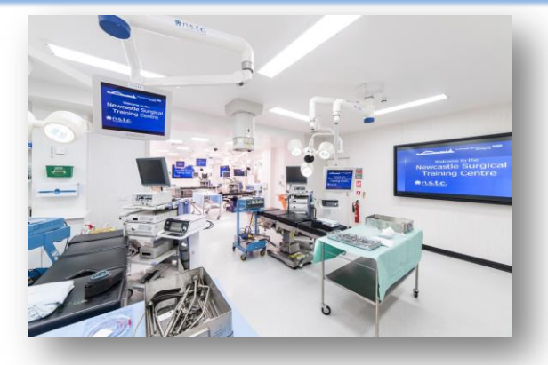
Newcastle Surgical Training Centre